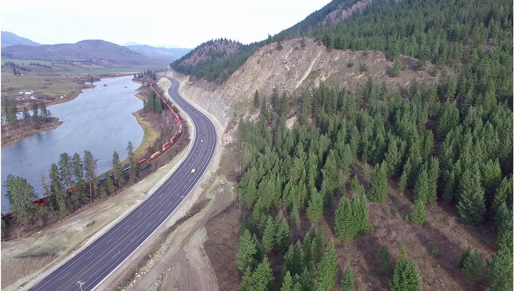
Hoffman Phase 2 at Completion