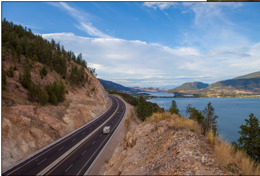
Highway 97, Winfield to Oyama