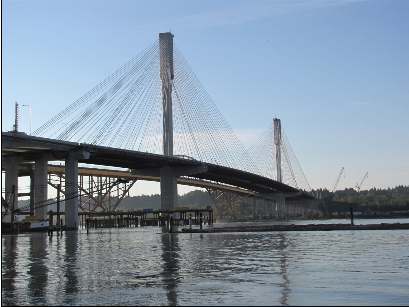
Highway 1, Port Mann Bridge