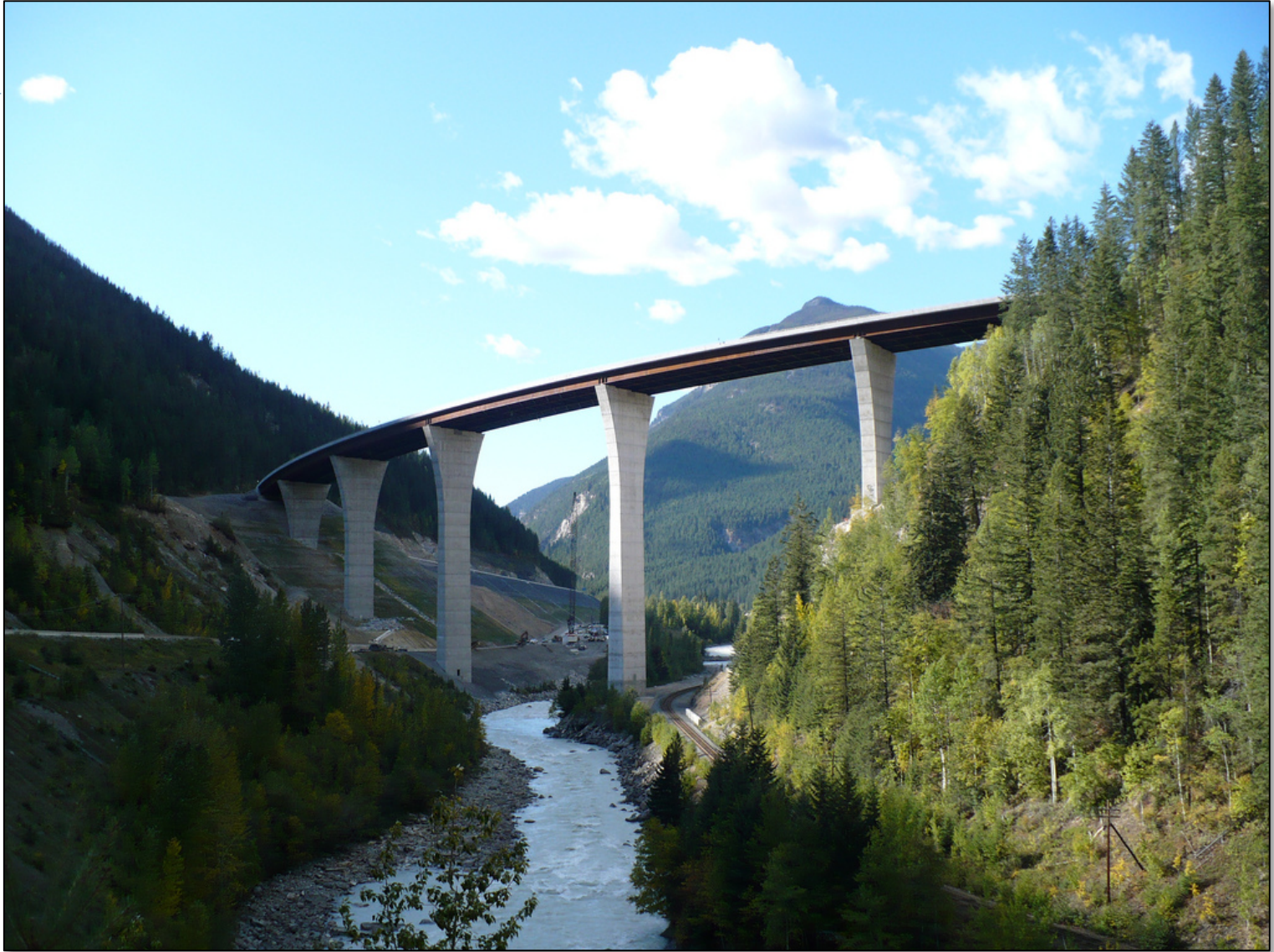
Highway 1, Kicking Horse Canyon