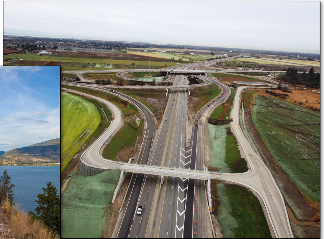
South Fraser Perimeter Road & Highway 99