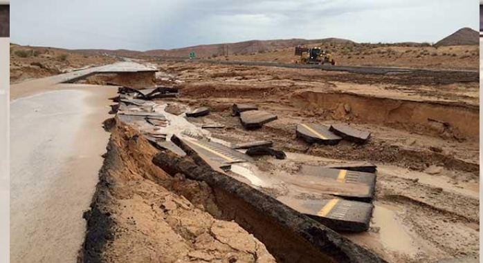
September, 2014 Near Moapa, NV