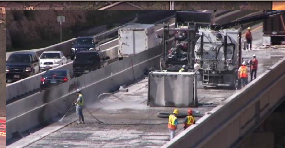
January 2015, Virgin River Gorge Bridge Construction, Arizona