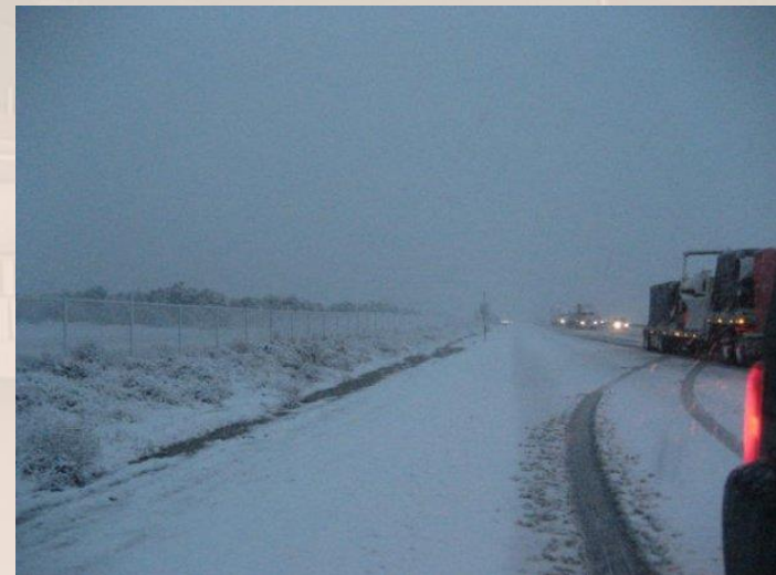
January 2010, Cajon Pass, CA